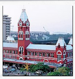
Chennai Egmore Railway station

Chennai Park Suburban Train Station (at walkable distance)